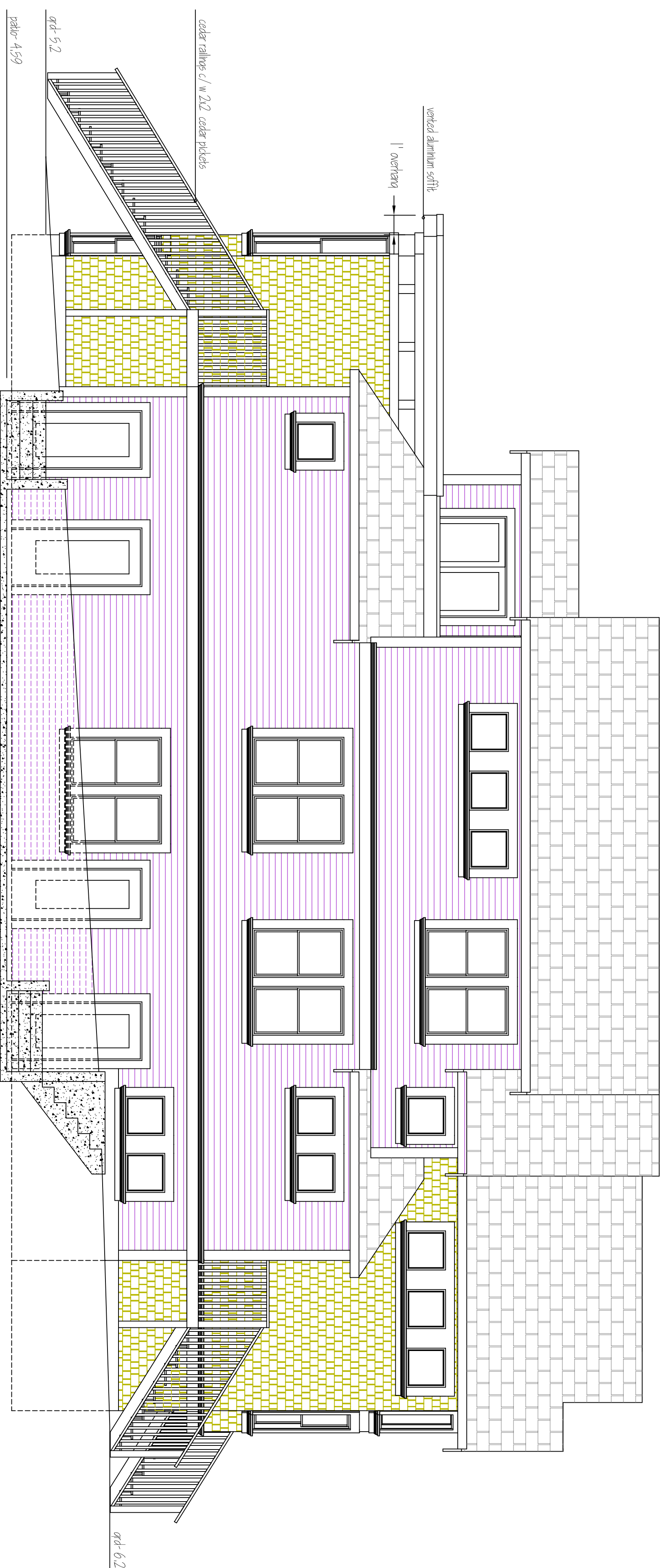
EAST patio side